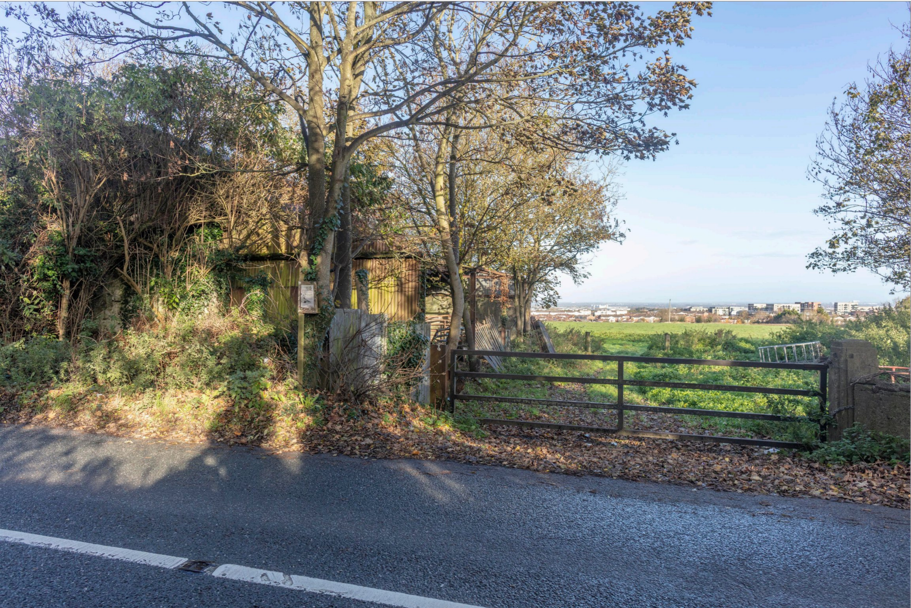
< 24mm / 73.7° < 35mm / 54.4° < 50mm / 39.6° Lens Information: Focal Length / Field of View 50mm / 39.6° > 35mm / 54.4° > 24mm / 73.7° >