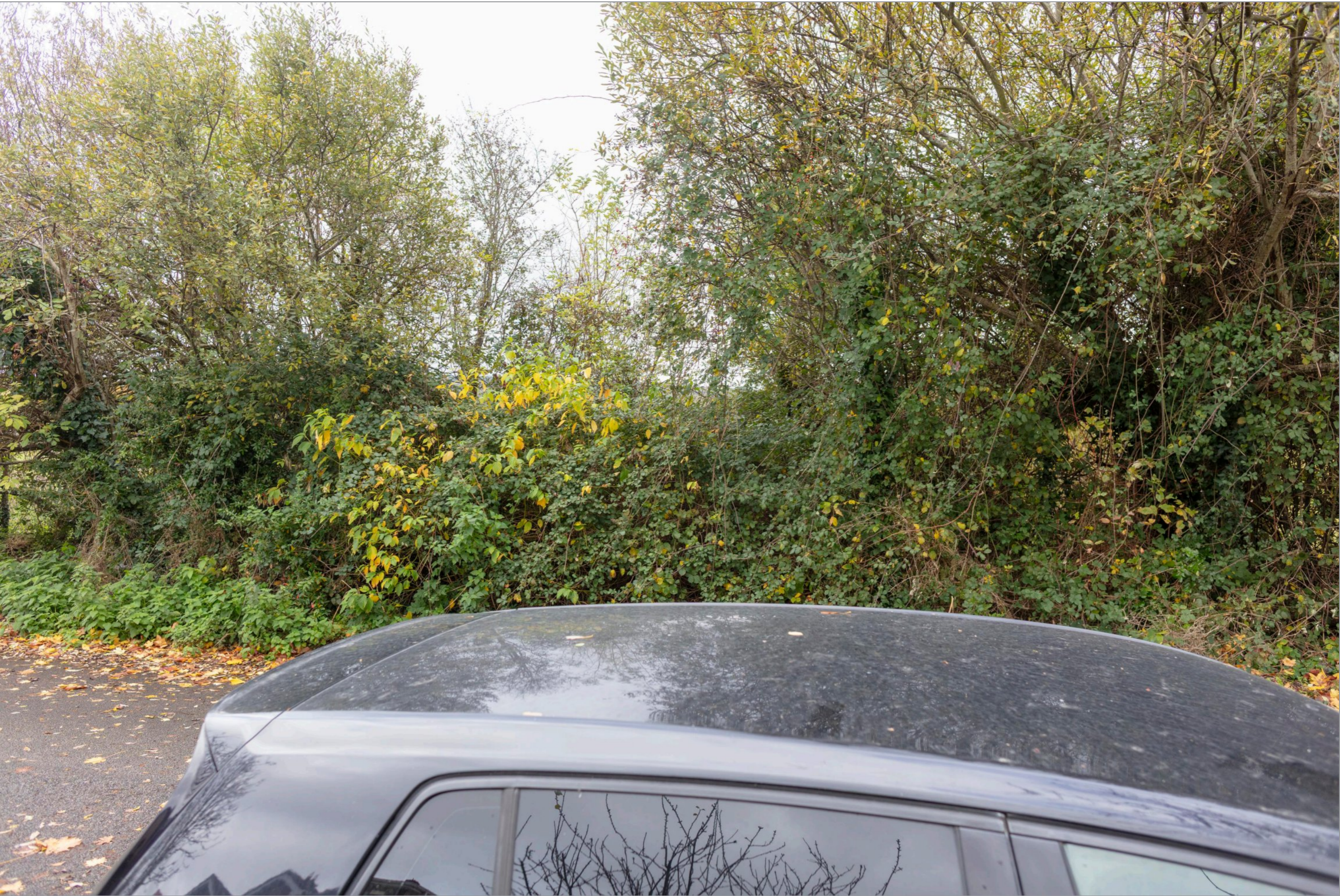
< 24mm / 73.7° | < 35mm / 54.4° | < 50mm / 39.6° | Lens Information: Focal Length / Field of View | 50mm / 39.6° > | 35mm / 54.4° > | 24mm / 73.7° > |