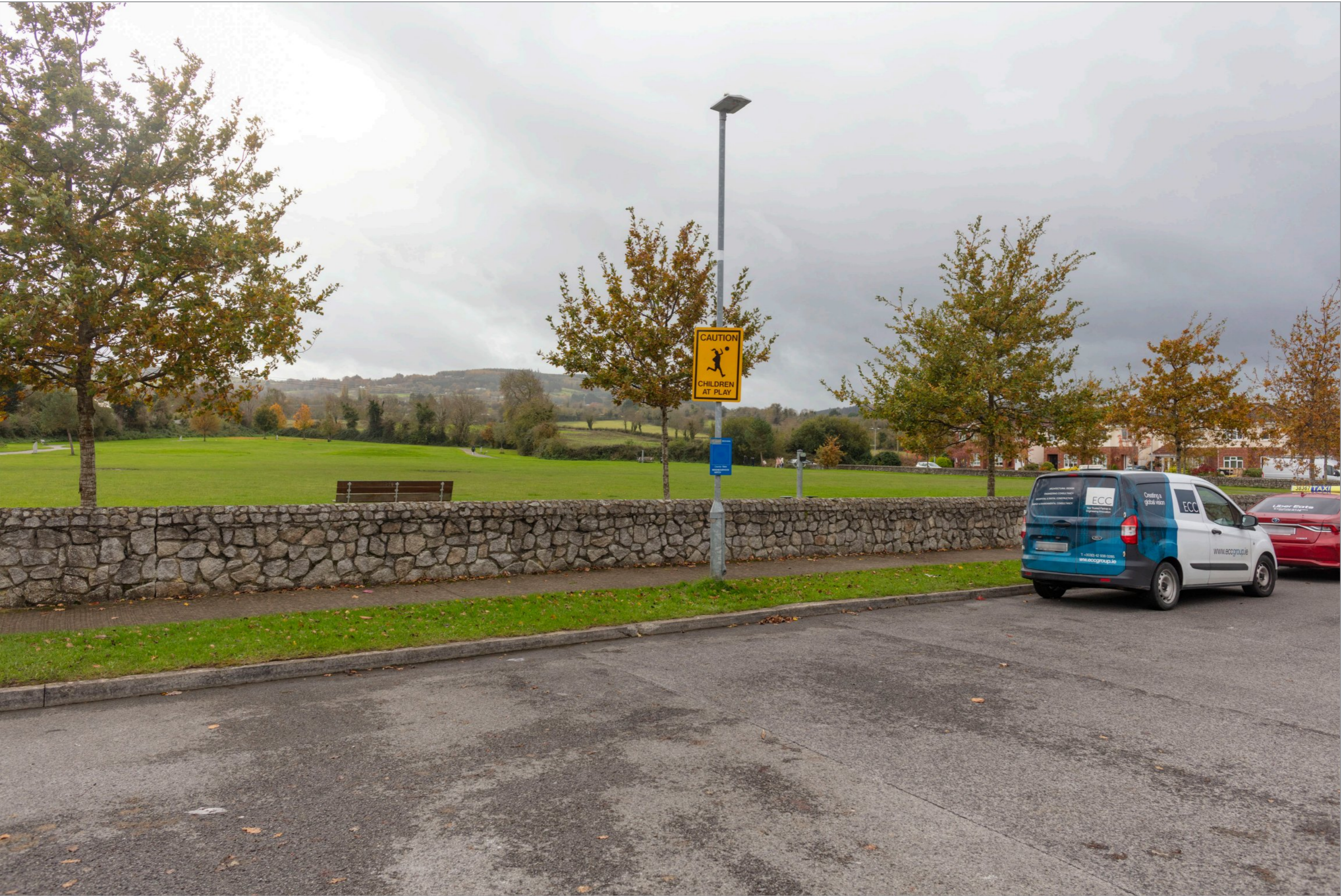
< 24mm / 73.7° < 35mm / 54.4° < 50mm / 39.6° Lens Information: Focal Length / Field of View 50mm / 39.6° > 35mm / 54.4° > 24mm / 73.7° >