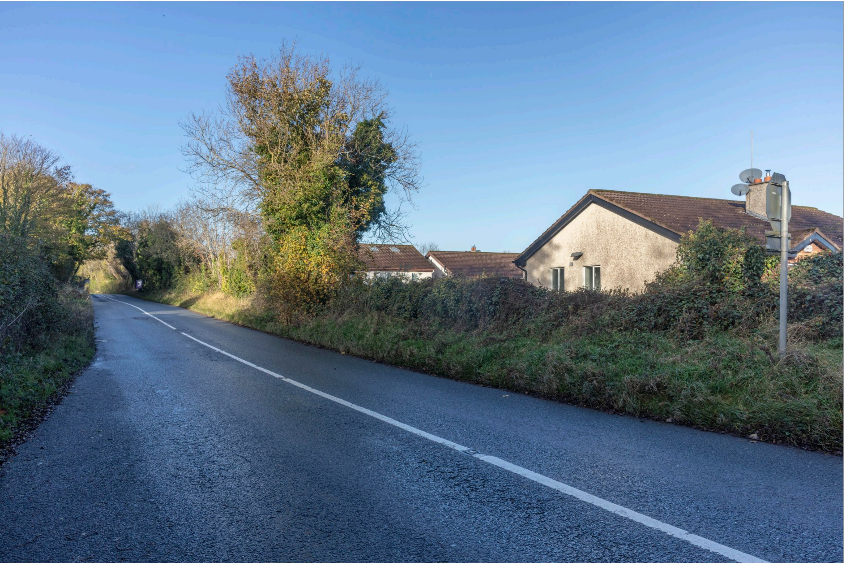
< 24mm / 73.7° < 35mm / 54.4° < 50mm / 39.6° Lens Information: Focal Length / Field of View 50mm / 39.6° > 35mm / 54.4° > 24mm / 73.7° >