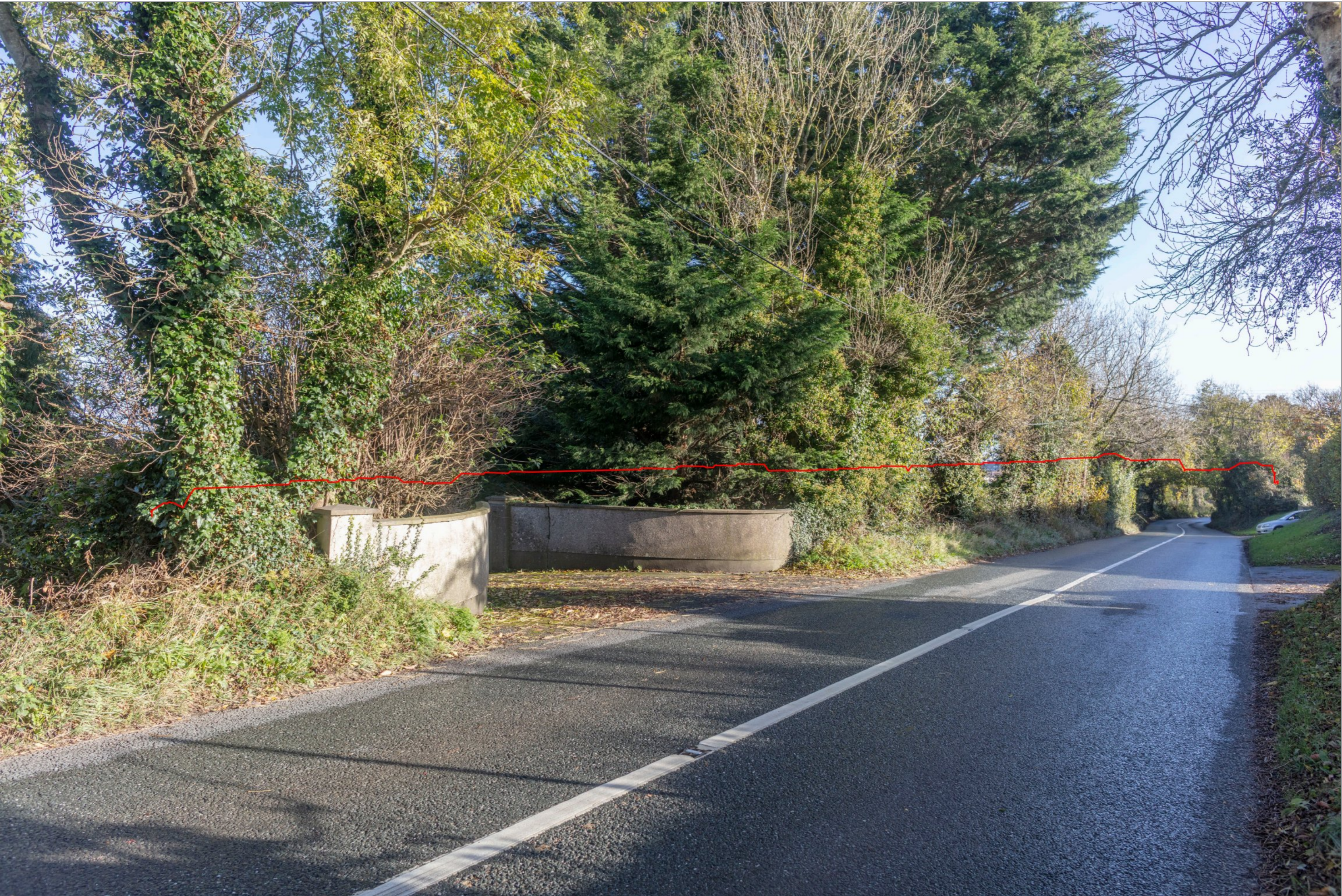
< 24mm / 73.7° < 35mm / 54.4° < 50mm / 39.6° Lens Information: Focal Length / Field of View 50mm / 39.6° > 35mm / 54.4° > 24mm / 73.7° >