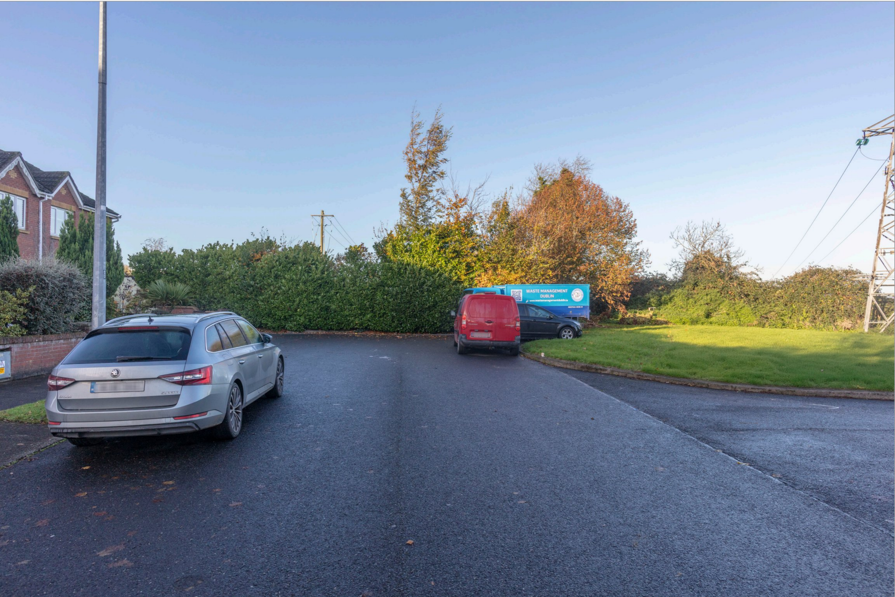
< 24mm / 73.7° < 35mm / 54.4° < 50mm / 39.6° Lens Information: Focal Length / Field of View 50mm / 39.6° > 35mm / 54.4° > 24mm / 73.7° >