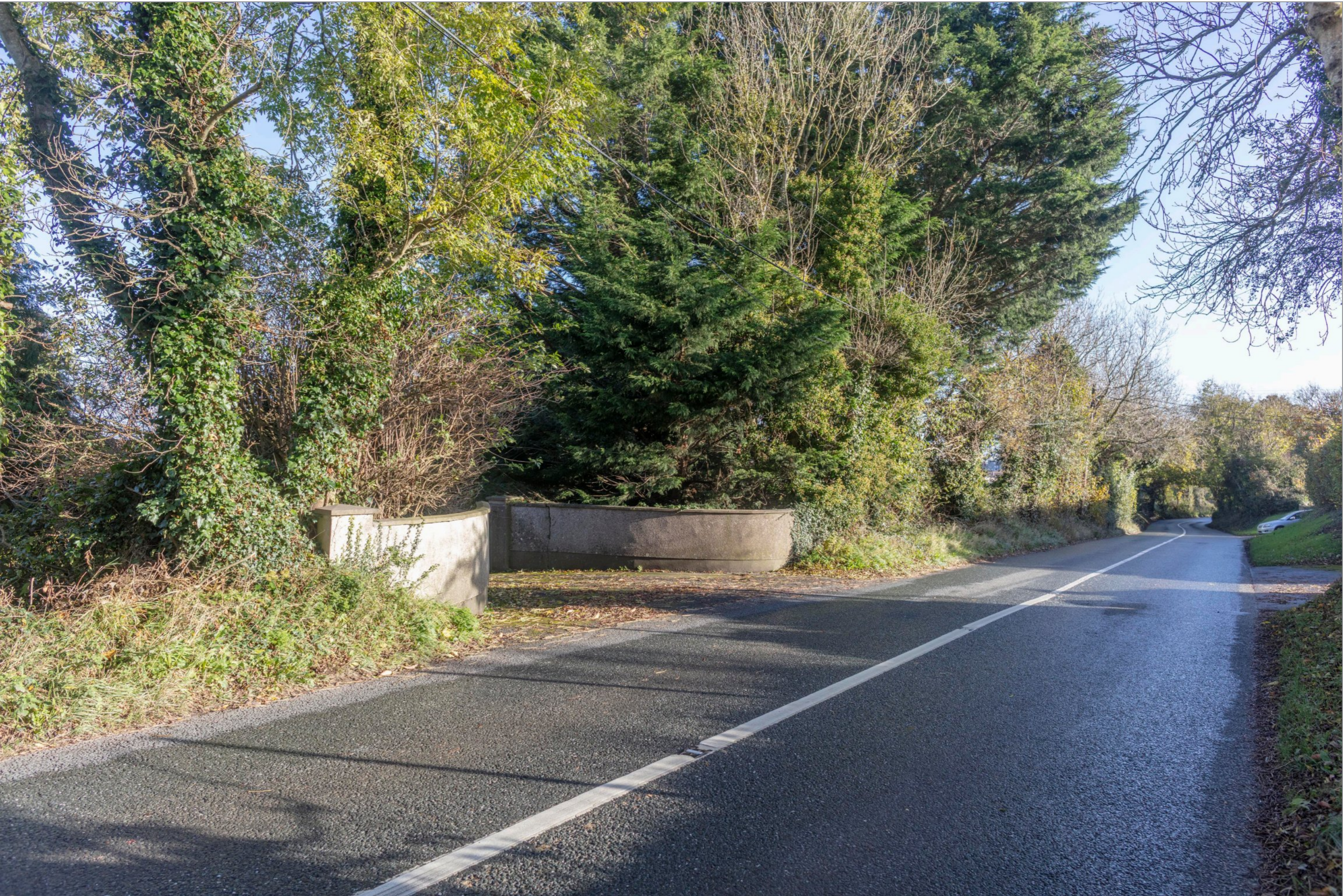
< 24mm / 73.7° < 35mm / 54.4° < 50mm / 39.6° Lens Information: Focal Length / Field of View 50mm / 39.6° > 35mm / 54.4° > 24mm / 73.7° >