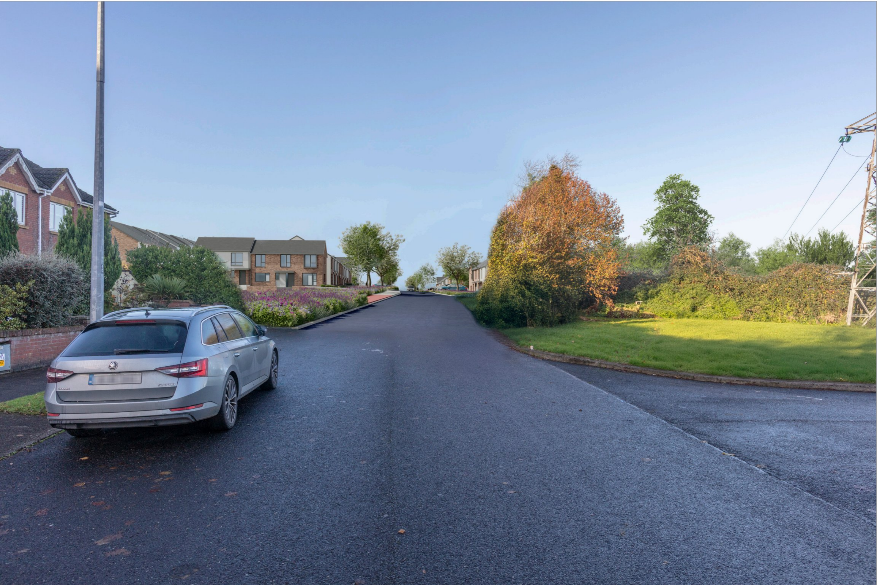
< 24mm / 73.7° < 35mm / 54.4° < 50mm / 39.6° Lens Information: Focal Length / Field of View 50mm / 39.6° > 35mm / 54.4° > 24mm / 73.7° >