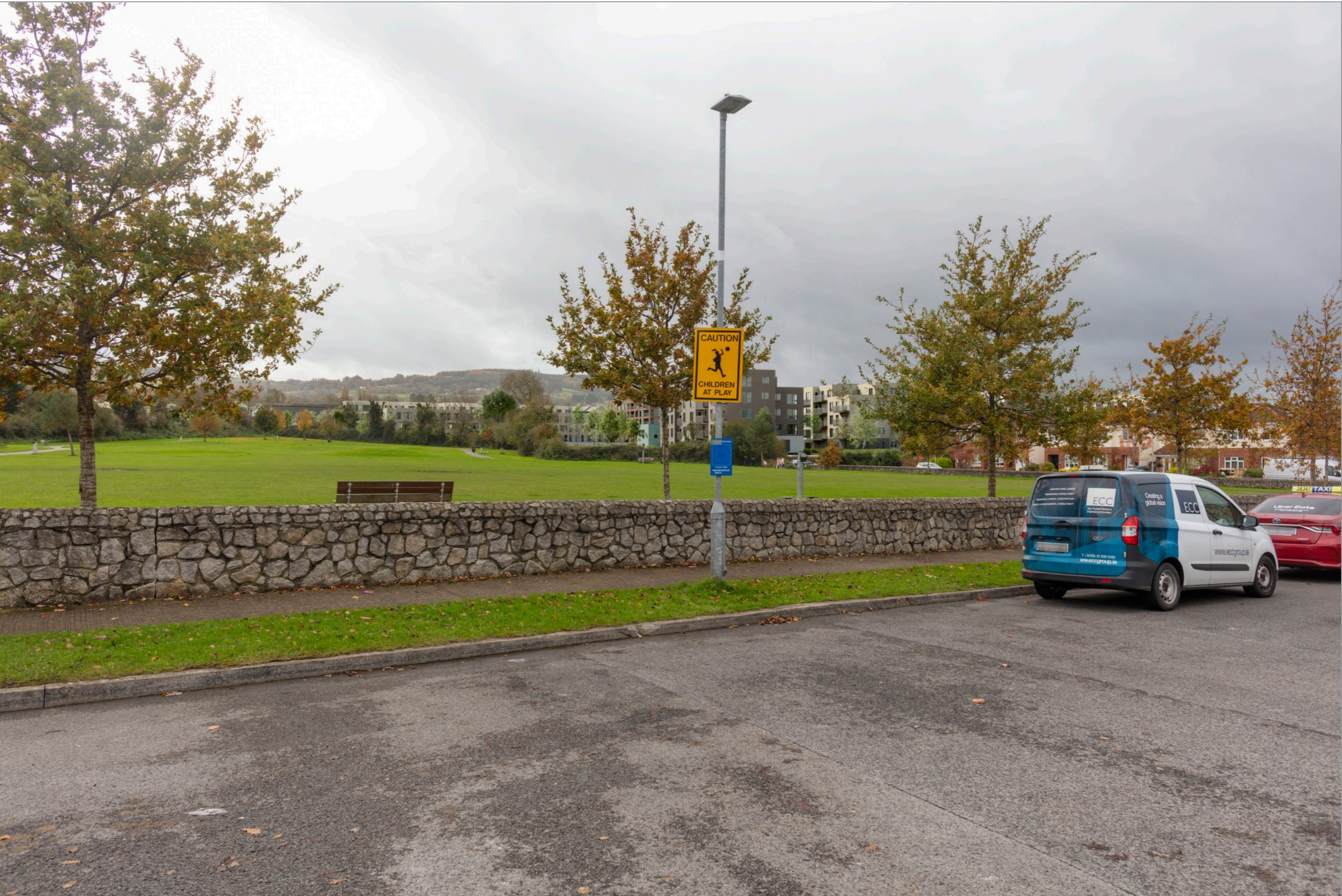
< 24mm / 73.7° < 35mm / 54.4° < 50mm / 39.6° Lens Information: Focal Length / Field of View 50mm / 39.6° > 35mm / 54.4° > 24mm / 73.7° >