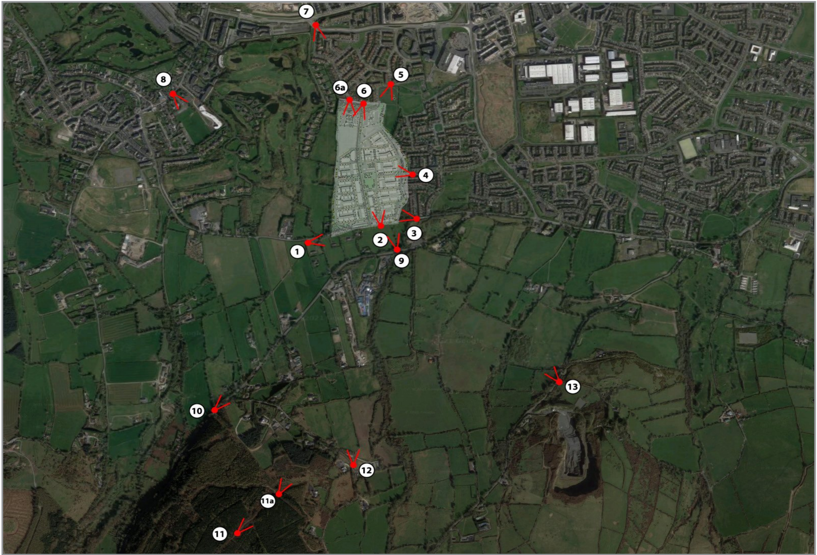
View Location Map

This map is for view location purposes only. Please refer to Architects drawings for site layout and redline boundary.